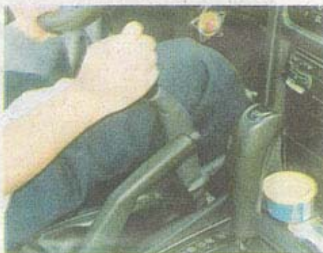
THE CAROSPEED'S ergonomic design fits in almost seamlessly into the driver's cockpit.

But the contraption was disapproved when he brought the car for inspection to the Land Transportation Office, a requirement when Cas-