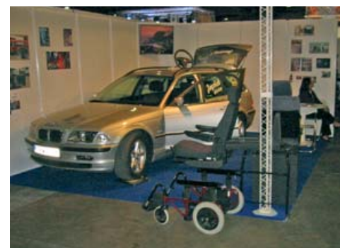
The A.C.A Belgium Stand