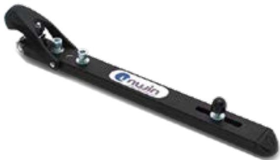
Black Seat Locker (ULB)